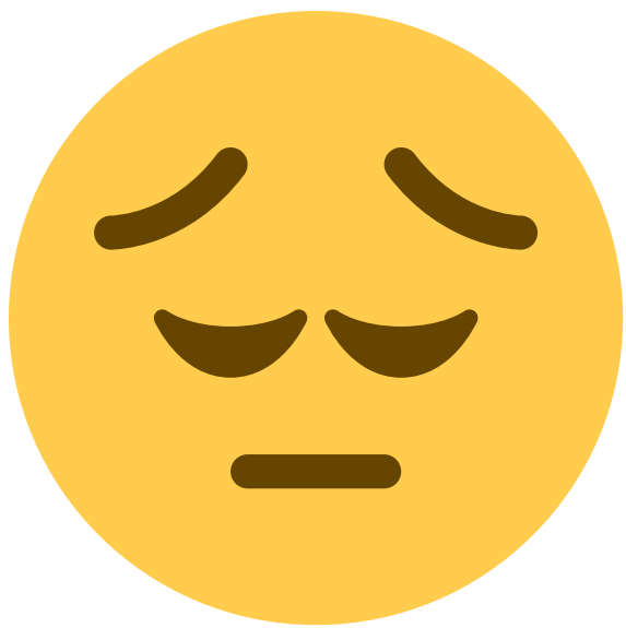
Feel sick in the tummy