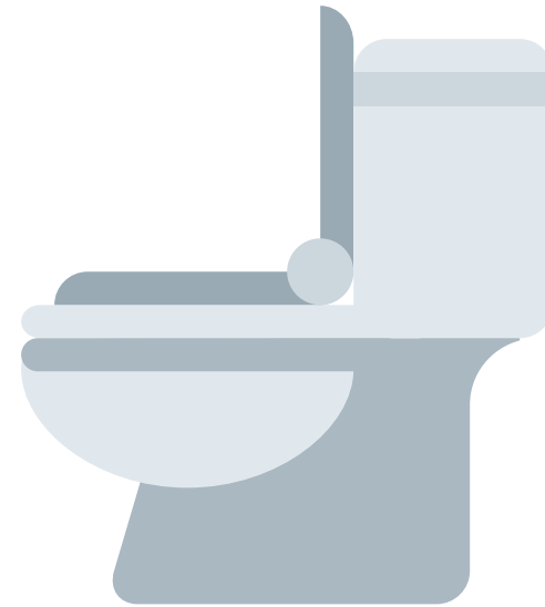
Need to go to the toilet