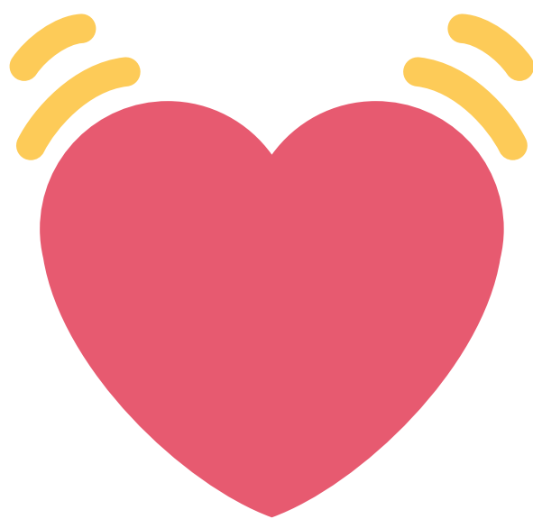
Heart beats fast